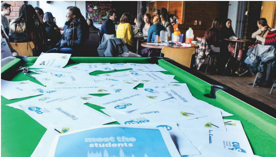
Meet the students - a shadowing scheme encouraging teenagers to apply to Cambridge University