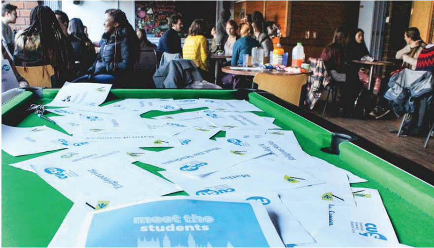
Meet the students - a shadowing scheme encouraging teenagers to apply to Cambridge University